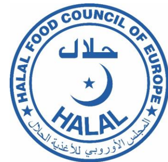
Halal Food Council of Europe (Belgium)