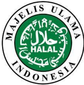
The Indonesian Council of Ulama (Indonesia)