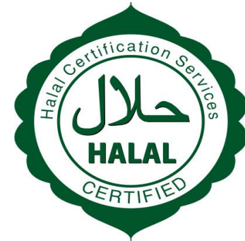
Halal Certification Services (Switzerland)

FOREIGN HALAL BODIES & AUTHORITIES IN THE WORLD