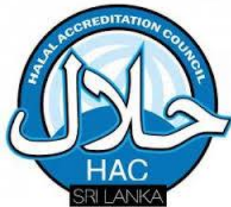
Halal Accreditation Council (Guarantee) Limited (Sri Lanka)